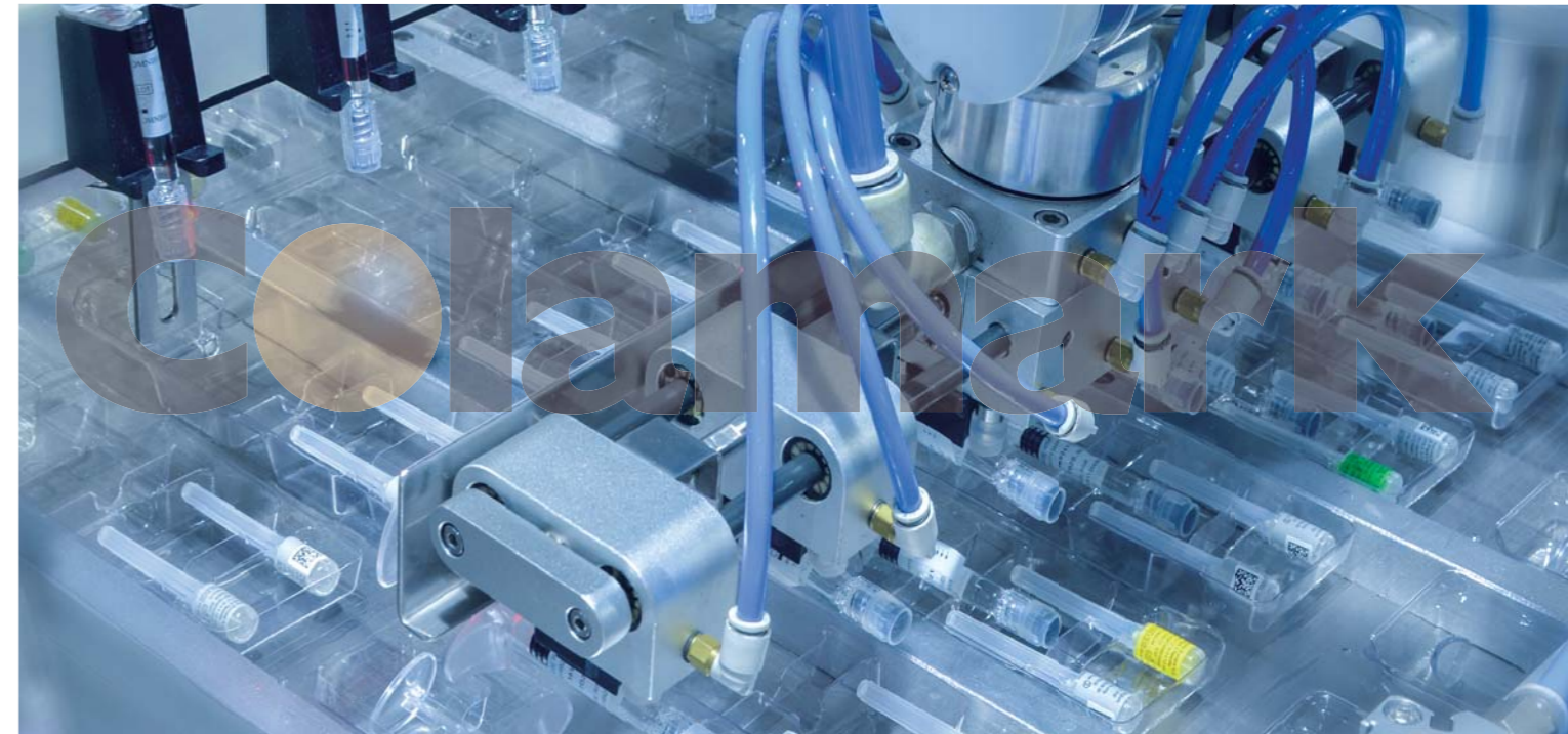
Blister Packaging System | B200